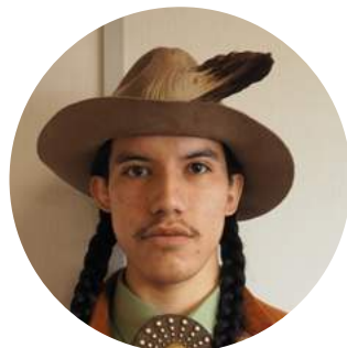
Tiran Smallboy-Zorthian Mountain Cree Camp